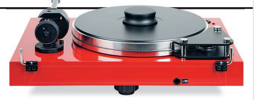
ABOVE: A socket at the rear accepts the 15V DC input from the supplied power pack. One of the deck's three magnetically-decoupled feet can also be seen here

crisp and yet mellow all in one. Some older Pro-Ject arm designs have tended to exhibit a certain fizziness across the upper midband and treble but, as suggested in the Lab Report, the new 9CC Evolution has successfully overcome these and the result is a clarity and insight that puts it right up there with the best of its contemporaries at the arm's price point.